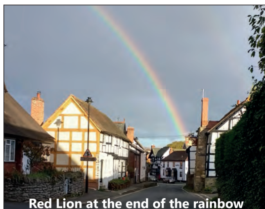
Red Lion at the end of the rainbow