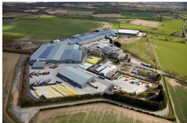
Kingspan Insulation's Pembridge site has recently been awarded a World Class Operation Management Gold award.

As part of the WCOM process, the facility will be externally audited and scored every single year. This will help to support Kingspan Insulation's programme of continuous improvement, with a particular emphasis being placed on further improvements in quality, staff training and engagement.