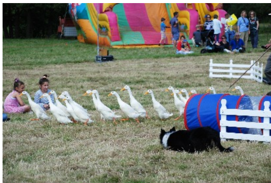
Above: The Quack Pack doing their thing.