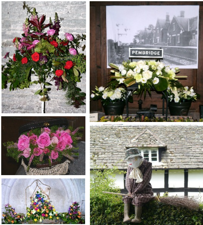
Here are a few photos from our beautiful Flower and Music Festival, with further articles and photos to follow in the next edition!