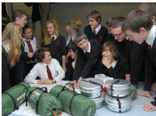
Pupils at Lady Hawkins School have received new equipment for their Duke of Edinburgh programme thanks to funding from the Kingspan Insulation Community Trust.

Prepared by: Smith Goodfellow Limited, Macclesfield, Cheshire