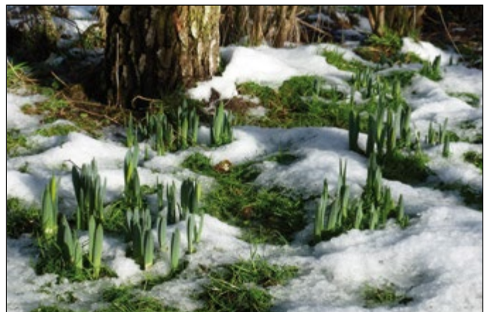
Pl pleasing green shoots - unfortunately not of the economic kind

Monday: 2.30 to 3.30pm Tuesday: 1.30 to 2.30pm Wednesday: No service Thursday: 4.00 to 5.00pm Friday: 1.30 to 3.00pm Saturday: 9.00 to 10.00am