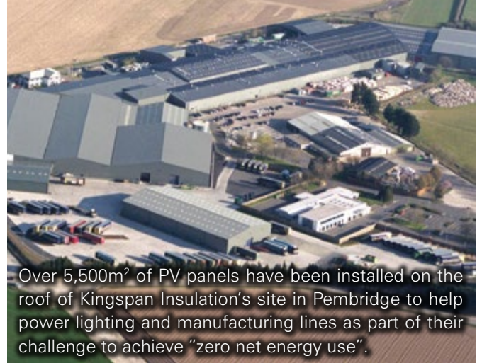
Over 5,500m 2 of PV panels have been installed on the roof of Kingspan Insulation's site in Pembridge to help power lighting and manufacturing lines as part of their challenge to achieve "zero net energy use".

With concerns about our environment and rapid rises in gas and electricity prices, we've all been trying to reduce our energy usage. Kingspan Insulation is going one step further by introducing a range of new measures in a bid to achieve "zero net energy use", including covering the roof of its site in Pembridge with photovoltaic (PV) panels.