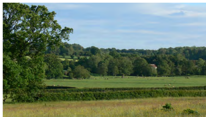
The view from a Cooks Kitchen