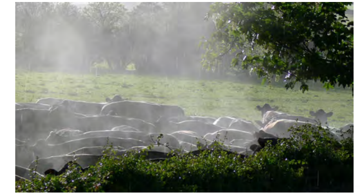
Cows steaming in a sun shower at the end of the garden. ed.