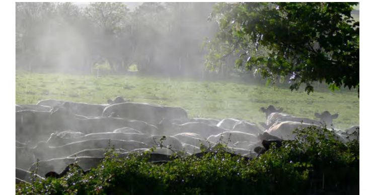
Cows steaming in a sun shower at the end of the garden. ed.