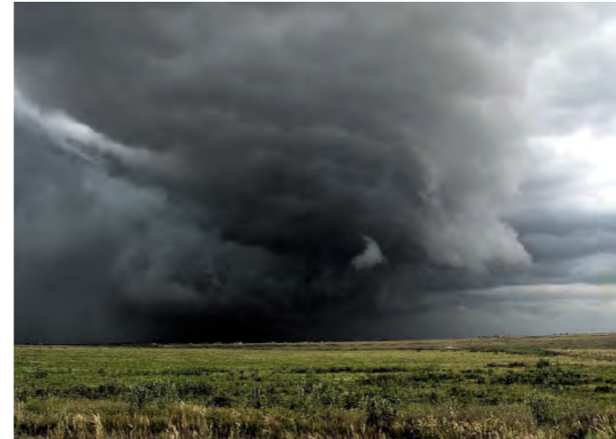
Spectacular hailstone cloud over north Herefordshire