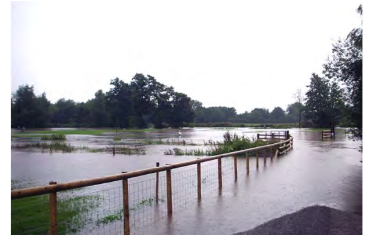
Down at The Leen it was a bit damp under foot !

Hailstorms, constant rain, high winds, plague of frogs, we've had the lot this summer. It is officially the worst summer since 1912 if you include May (and I do) so lets hope we have a good September ! July 19th saw the village inundated with rain and the Arrow wreaking havoc from Kington to Ivington. Most people in the village had a story to tell. We were stuck, unable to get home for 48hrs and refugees from the New Inn were accommodated overnight in patrons houses. Properties along the river in the village had some flooding but thankfully it was not severe. We must be grateful that we fared better than the people on the Severn who must be at their wits' end and facing real problems with insurance. Thankfully, it gradually receded over the next few days and we got back to normal. With so much rain on the fields it only requires a few hours of heavy rain to set it off so we're not out of the woods yet. But as I write the sun is shining and the forecast is set fair for a few days so we may salvage something from what has been a very poor summer.