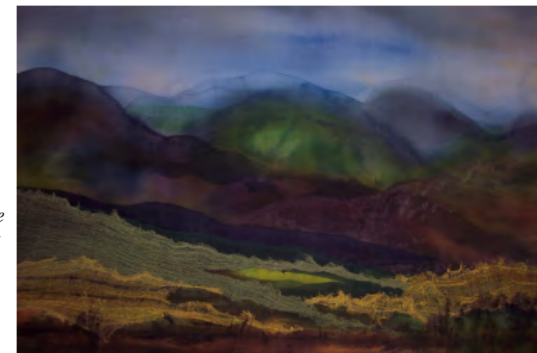
From the new exhibition at The Old Chapel Gallery

Please ring Kate Best - 01544 318513 for more information and booking