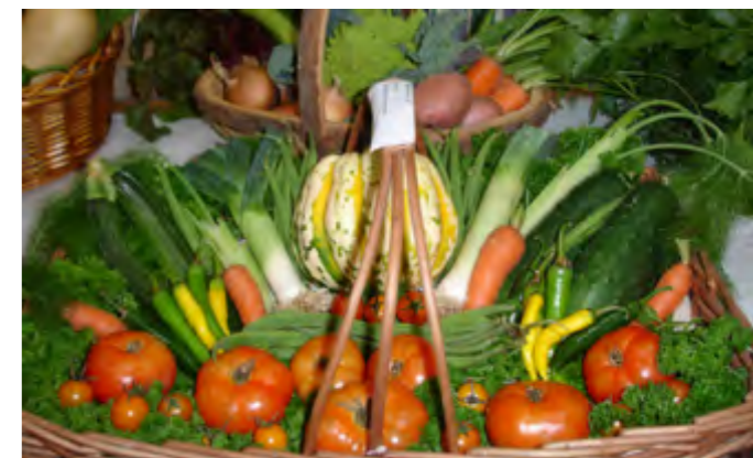
Here is great example from Eynsham Village Show

Editor : Glyn Whiting tel: 01544 388497 email : glynwhiting@tiscali.co.uk Publication deadline : Aug15th 2007 www.mediaeval-pembridge.com www.pembridgeamenitytrust.co.uk www.pembridgechurch.org.uk