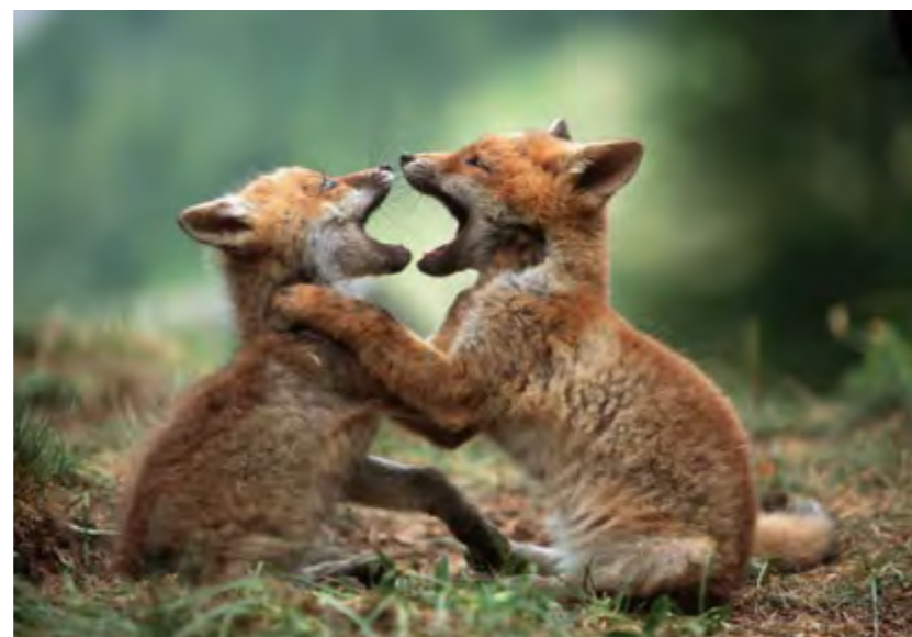
Two little fox cubs without a care in the world