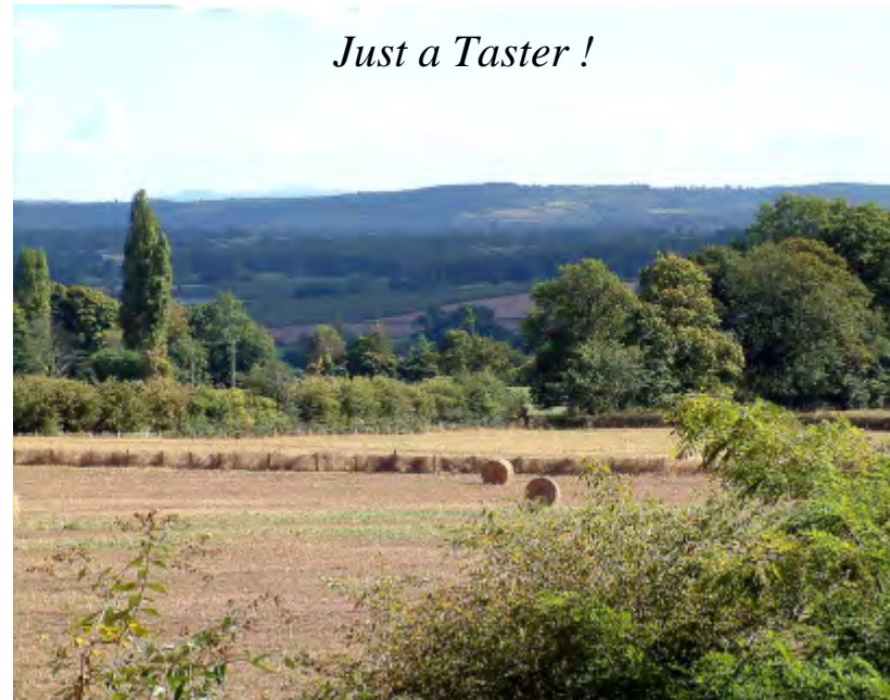
Summer is still a long way off so just to remind you, here's Herefordshire in all it's Summer finery.